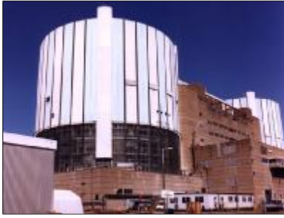
Over 10 years of work at Oldbury