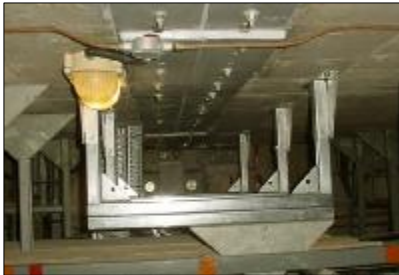
Plate bonding to soffit