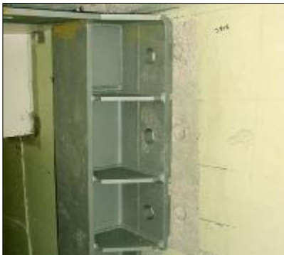
Wall bracket during installation