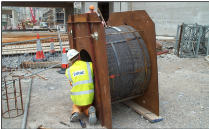
Strand dispenser ready for pushing