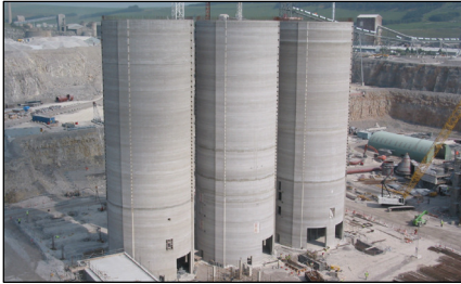
Three of the seven silos