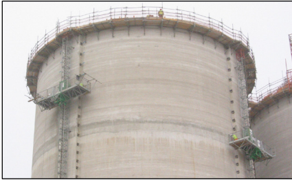
Work carried out from mast climbers