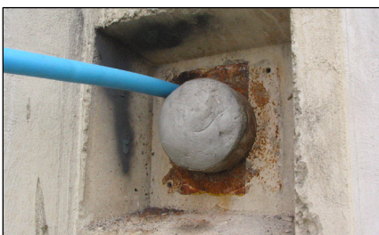
Finished anchor prior to pocket filling

Silo contract demonstrates Balvac's ability to successfully secure and carry out one of the largest and most demanding post tensioning contracts let in the UK.