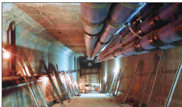
Additional tendons installed inside the box section